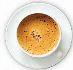
LUNGO ☕ HOT 90.-