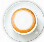
CAPPUCCINO ☕ HOT 110.- 🥛 ICED 120.-