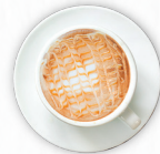
MACCHIATO ☕ HOT 90.-