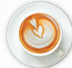
CAFE LATTE ☕ HOT 110.- 🥛 ICED 120.-