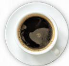
AMERICANO ☕ HOT 90.- 🥛 ICED 100.-

"ALL RECIPES ARE MADE WITH LAVAZZA CREMA E AROMA BLEND."