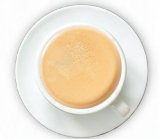
FLAT WHITE ☕ HOT 120.-