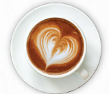
MOCHA ☕ HOT 120.- 🥛 ICED 130.-