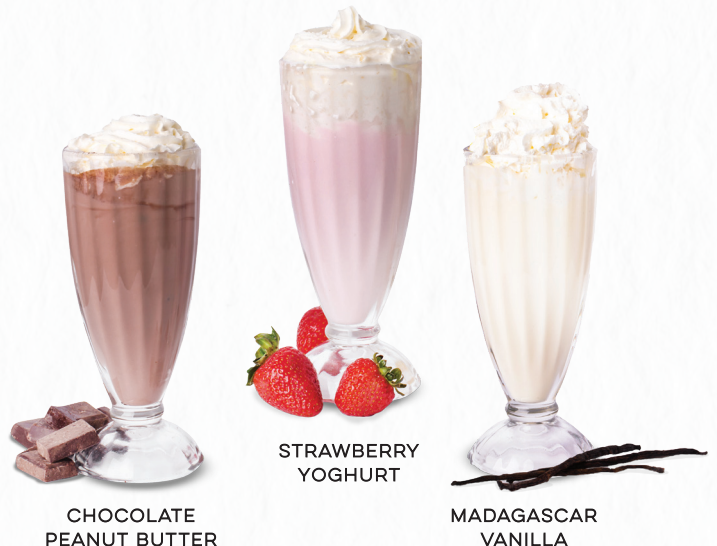
CHOCOLATE PEANUT BUTTER