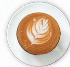
PICCOLO LATTE ☕ HOT 100.-